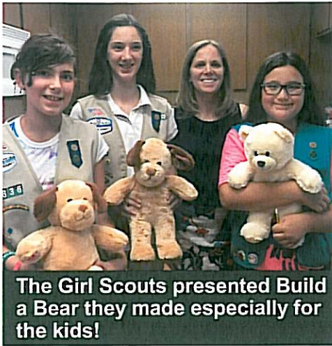
The Girl Scouts presented Build a Bear they made especially for the kids!